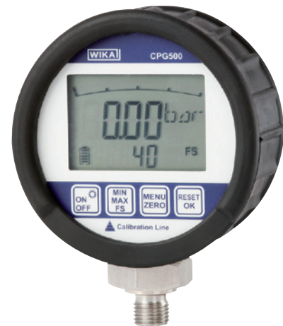
Digital pressure gauge CPG500

With a measuring rate of 100 measurements per second, the CPG500 features a very high measuring rate. With this, fast pressure peaks and drops in pressure can be detected. The bargraph display and drag pointer function integrated into the display, as well as retrievable MIN/MAX peak values, enable effective analysis of the measuring point.