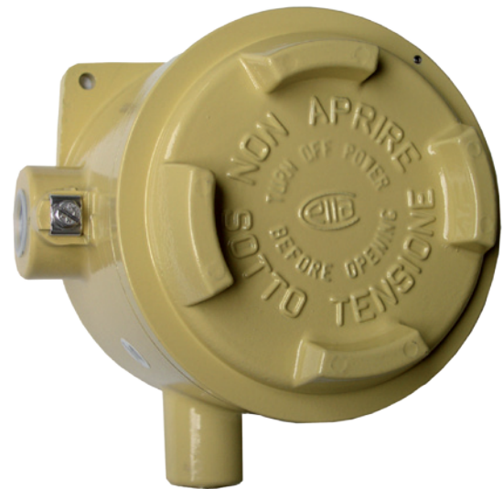
Bourdon tube pressure switch model BA1

All wetted parts materials are from stainless steel as standard. Each switch family is available in IP 65, Ex-ia or Ex-d versions (Ex-ia see model BWX, data sheet PV 32.20).