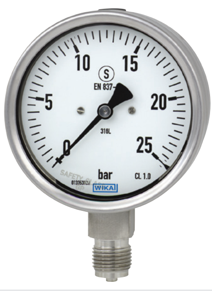
Bourdon tube pressure gauge model 232.30