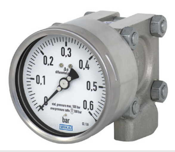
Differential pressure gauge model 732.14